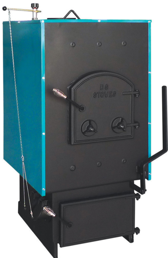
#3200 Shown With Insulated Jacket Kit

This hydronic system requires no electricity to heat water for floor heating, baseboard, freestanding radiators, heat pumps, or domestic water. They work well with new or existing oil or electric boilers. Our boilers circulate water in the front to prevent cracking. Each unit is pressure tested to 120 PSI and has a powerful heat exchanger for maximum efficiency. Constructed from 1/4" steel, the Aqua-Gem boilers easily maintain water temperature and feature a large capacity ash pan. All of our boilers are designed with a superior cast iron grate system and built to last.