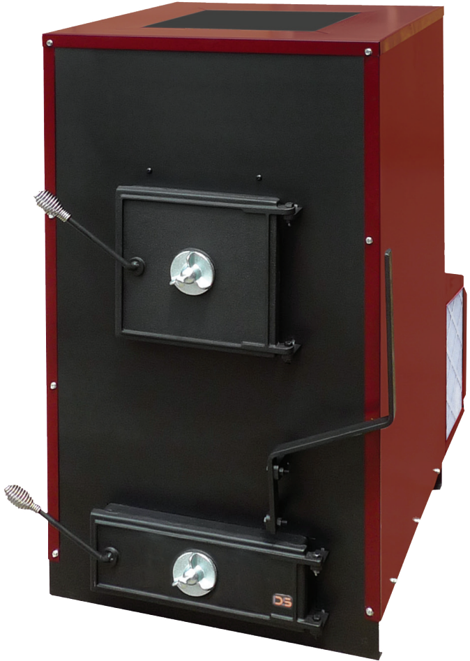
#100-14 Shown w/ Filter Box Installed #300-09 Shown On Front Cover

Our goal is to serve your needs with a very efficient, clean burning furnace. The Kozy-King's reburn system and heat exchanger provide maximum efficiency with less fuel. This U.L. Tested anthracite burning furnace is thermostat controlled for even temperature. The Kozy-King comes with a 3-speed blower and a safety features to prevent overheating. The outside cabinet is insulated to minimize heat loss. You can use this unit independently or in conjunction with another furnace. The Kozy-King will heat your whole home, shop, or greenhouse.